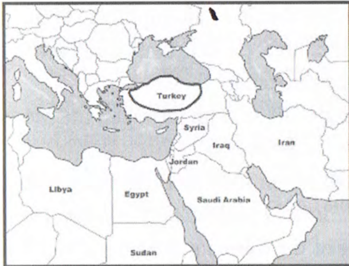
Gomer: North-Central Turkey