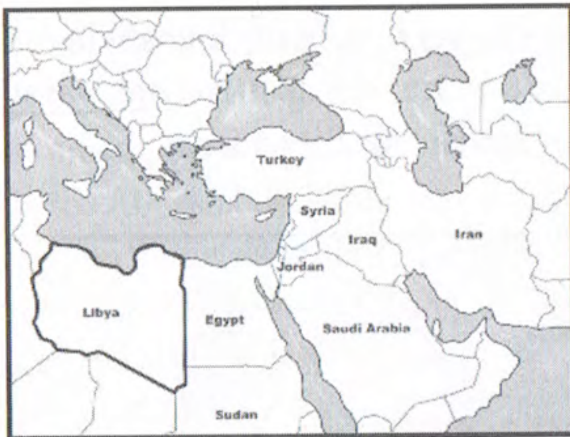
Put or Phut: General Region of Modern Day Libya